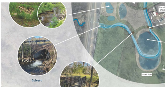
Mill Stream restoration: see story on page 5.

Primary Election: Tuesday, August 13, 7am – 8pm General Election: Tuesday, November 5, 7am-8pm