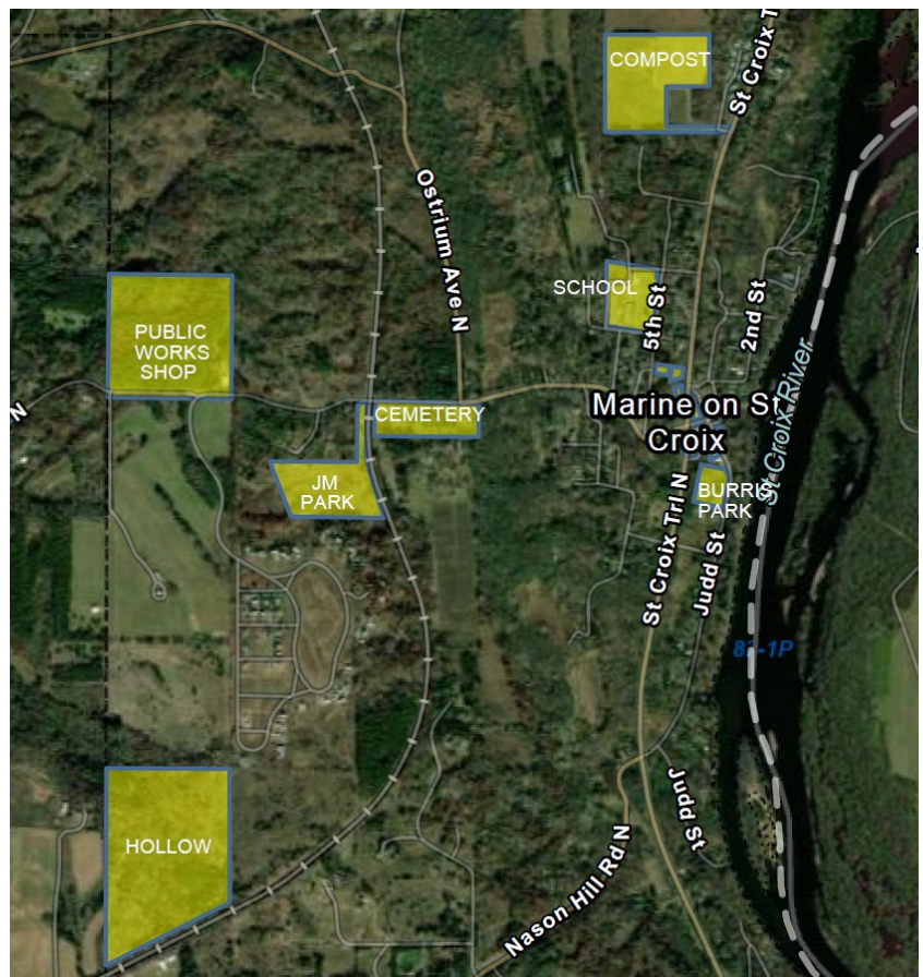
City-owned lands in Marine on St. Croix, highlighted in green.