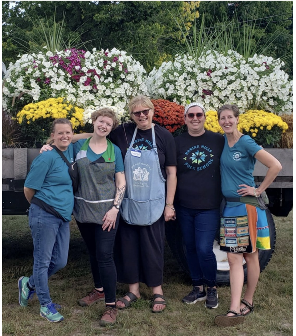
Marine Mills Folk School team members at the Marine Fall Festival, September 16.

You're welcome to drop in during any Community Events and see the school, staff levels permitting: Dare to Repair Fix-it Clinic (first Saturday of the month), Open Carving and Bluegrass Jam Session (second Saturday of the month), Beginner's Bridge (third Saturday and fourth Tuesday of the month), and Knit Night every Tuesday. No RSVP is necessary, just be sure to check the schedule online at MarineMillsFolkSchool.org first.